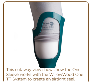
This cutaway view shows how the One Sleeve works with the WillowWood One TT System to create an airtight seal.